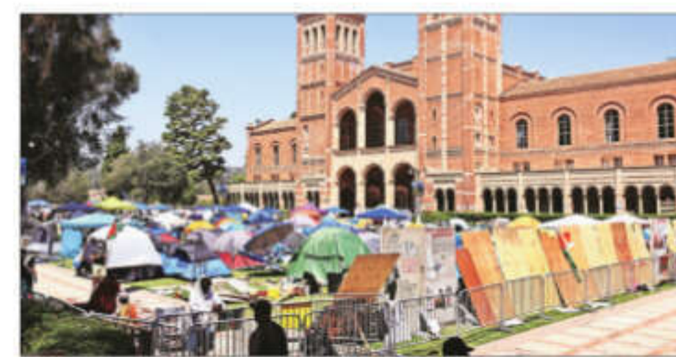
A file photo of the protest encampment at UCLA last year

Columbia University, the scene of some of the most dramatic protests against Israel last year, said the school will transform its approach to managing demonstrations.